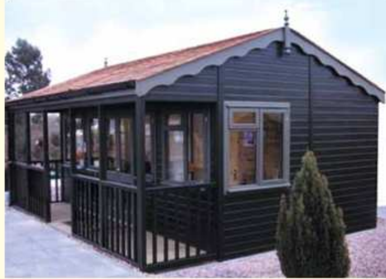
20' x 16' Henwick