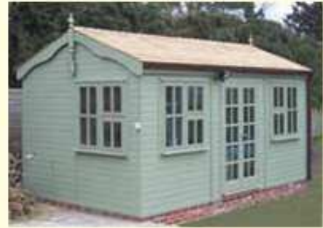
16' x 10' Hallow shown with cottage style windows and door

The roof of the Hallow is covered with bitumen roof tiles available in either black, red or green.