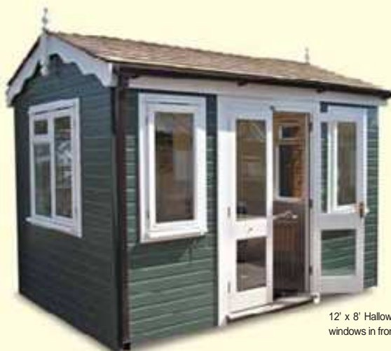
12' x 8' Hallow shown with optional double doors and half windows in front section