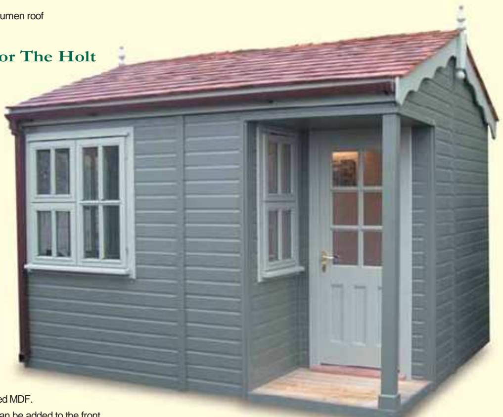
10' x 10' Holt shown with optional cottage style windows and door.

Guttering: Guttering and downpipes can be added to the front or back of your building