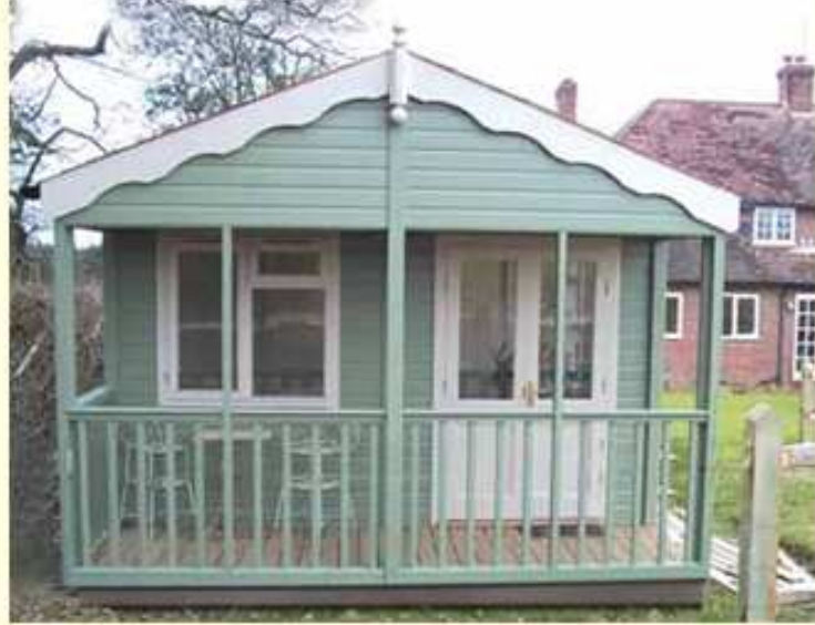
14' x 12' Henwick shown with verandah on gable end