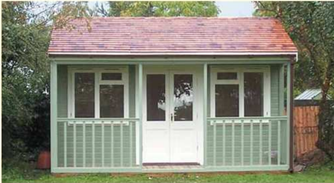
16' x 12' Henwick