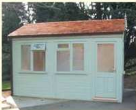
14' x 8' Hallow