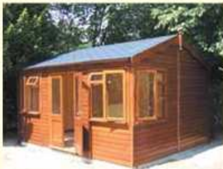
16' x 10' Hallow shown with optional double doors and in the standard medium oak colour