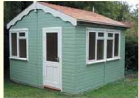
10' x 10' Hallow shown with door in gable end