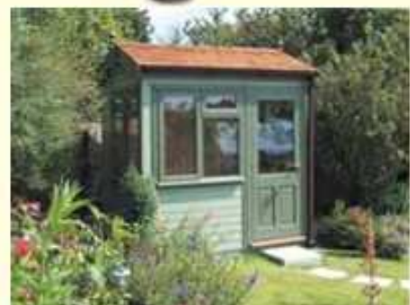
8' x 6' Hallow