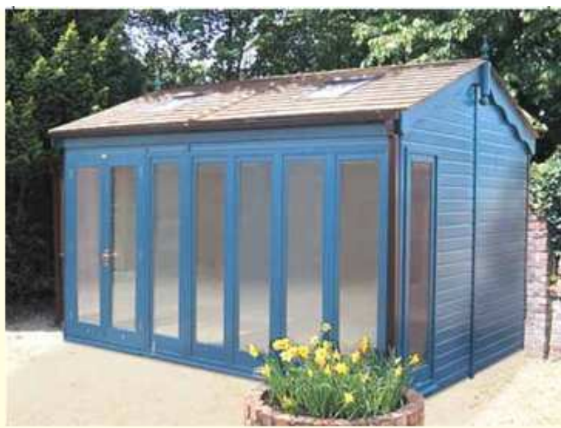
14' x 10' Hanley shown with one extra glass to ground window and two velux roof windows