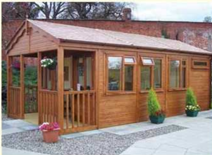
24' x 12' Henwick shown with verandah on the gable end

The Henwick is a traditionally styled garden room which can be used for many purposes - business or pleasure.