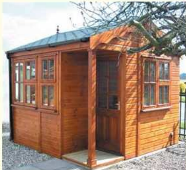
10' x 10' Holt shown with optional cottage style windows and door in standard oak finish

The roof of the Holt is covered with bitumen roof tiles available in either black, red or green.