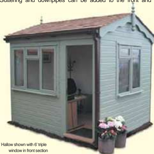
12' x 8' Hallow shown with 6' triple window in front section

Guttering: Guttering and downpipes can be added to the front and back of your building.