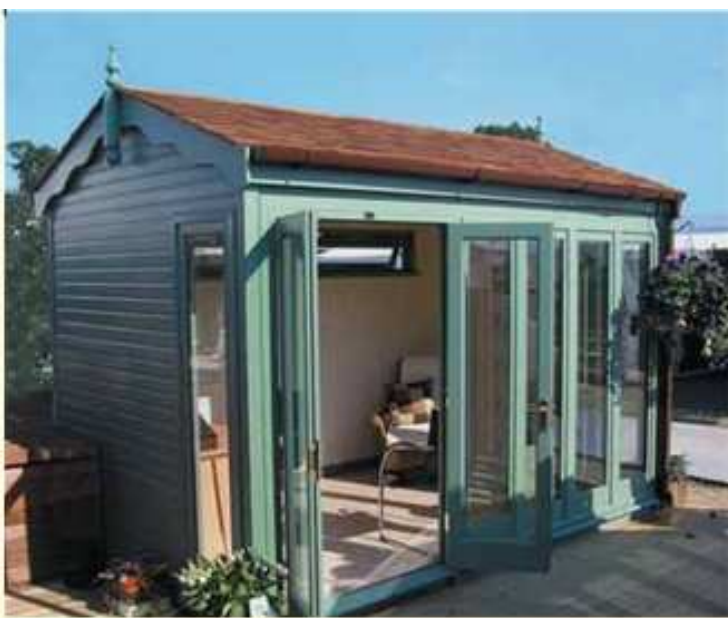
12' x 8' Hanley