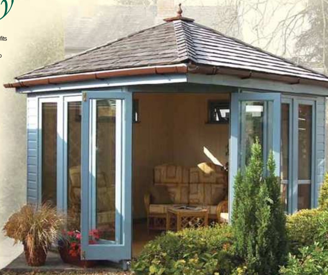
10' x 10' Corner Hanley

The Corner Hanley has an 'hipped' style roof rather than a traditional apex style, otherwise the specifications are the same as the Hanley.