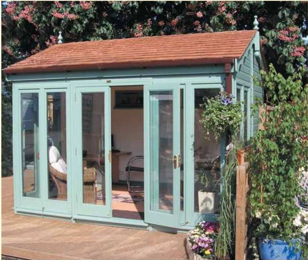
14'x 10' Hanley shown with two extra glass to ground windows

The very attractive Hanley makes a stunning feature in any garden. The patio style glass to ground windows allow natural light to pour into the building giving you the feeling of being out in your garden all year round.