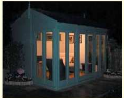
12' x 10' Hanley shown with two extra glass to ground windows

Guttering: Guttering and downpipes can be added to the front and back of your building